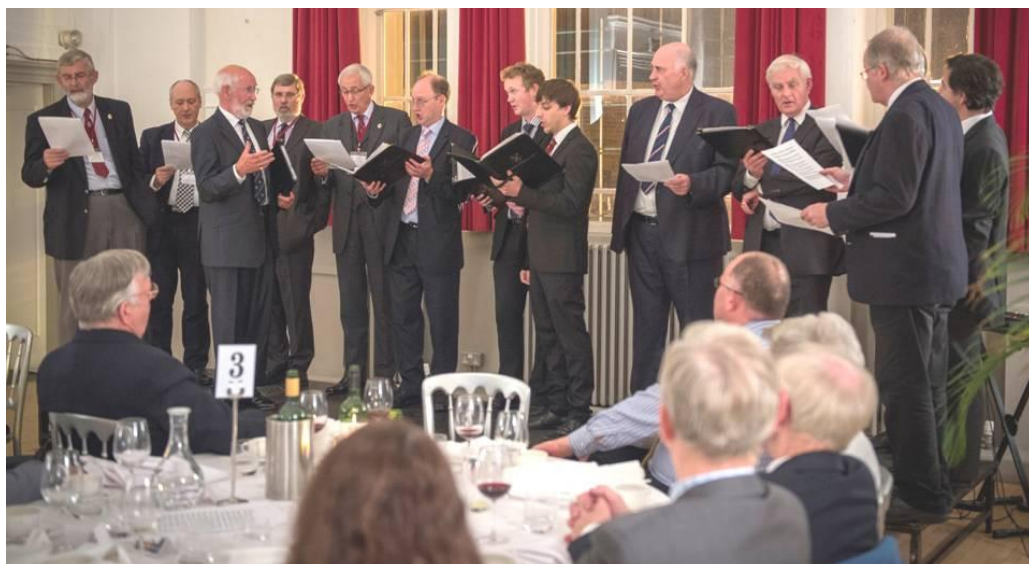
The finale – "My Evaline" sung by Cathedral Lay Clerks & Delegates