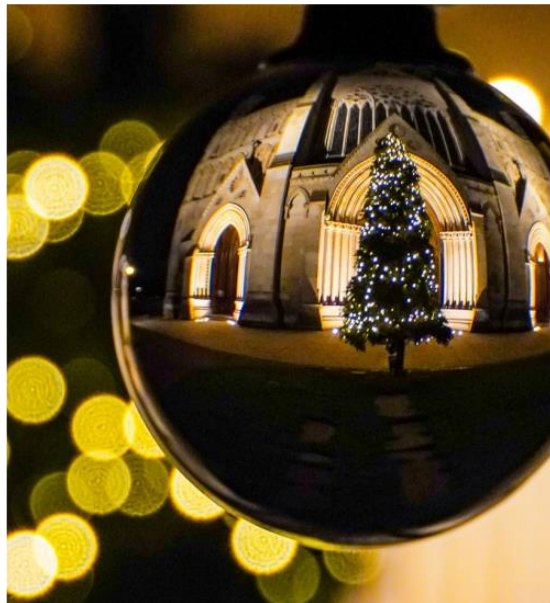
Christmas at the Cathedral was very different this year.

2020 has been the hardest for many in living memory, directly affecting all aspects of our lives and re-writing the rule books, quite literally. The impact on us all has been, and in many cases continues to be significant; but there is hope and light at the end of the tunnel now that the vaccination programme has commenced. Many of our members have received the vaccine already with many more expected to receive in the coming months. Quite when we return to normal is unknown, with the majority of schools closed to all except children of key workers, many employees still furloughed and many places of worship closed, other than for private prayer. Services at the Cathedral continue regularly and are streamed live on YouTube .