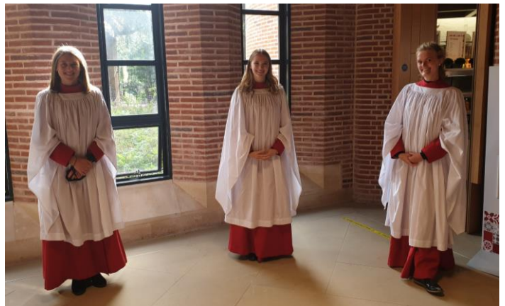
Three socially distanced ex-choristers provided ¾ of the top line for the four identical Ordination services at the end of October 2020.

The Advent Procession became an Advent Carol Service on the second Sunday of Advent, a week later than normal and just 3 days after the boys were able to return to rehearse. They rose to the challenge and sang magnificently - I doubt that anyone would have realised that they pulled it off in such a short space of time.