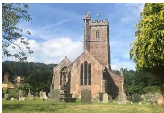
Church of St Mary, Luccombe

Please could I ask any members who are interested in attending to let me know numbers as soon as possible to assist with the details of the planning.