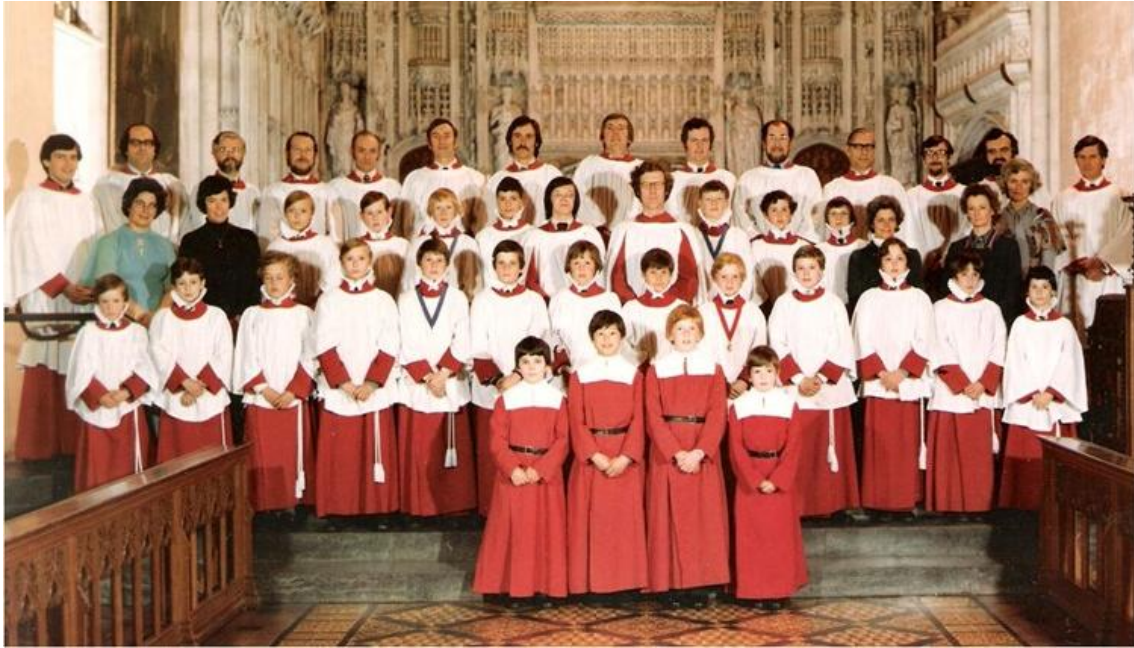
St Albans Cathedral Choir 1978